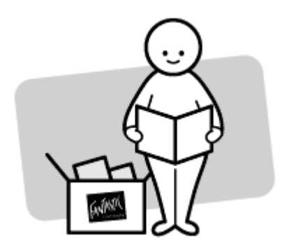
Read through the instructions carefully before you begin.