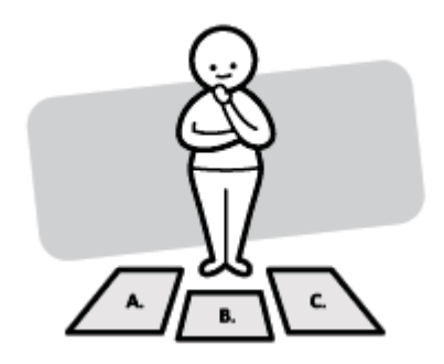
Identify and lay out all of the components before you begin assembly.